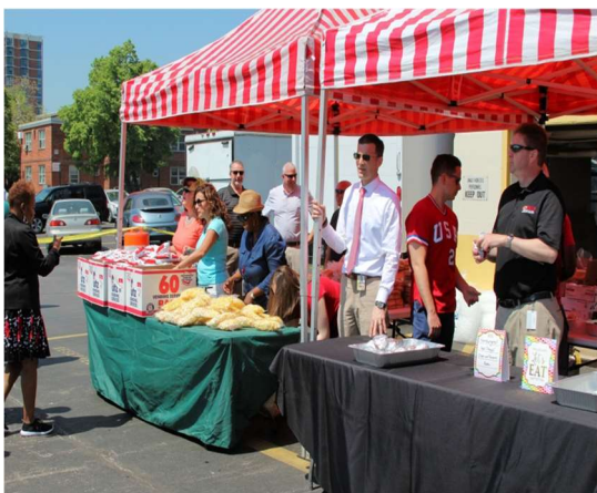
Senior leaders at the Maryland Department of Labor served lunch to the staff during "State Employee Appreciation Day."

Lastly, with the passage of the Maryland Healthy Working Families Act in 2018, the Office of Small Business Regulatory Assistance (OSBRA) was formed. The unit works closely with the Division of Labor and Industry within the Maryland Department of Labor and is dedicated to assisting employers with compliance as well as facilitating discussions with employees regarding their rights under the new law. This new unit which functions within the Office of the Secretary has provided a coordinated outreach platform for other units and divisions within the agency. For instance, our office of Minority Business Outreach has worked hand and hand to reach out to customers proactively and together to talk about doing business with and in Maryland.