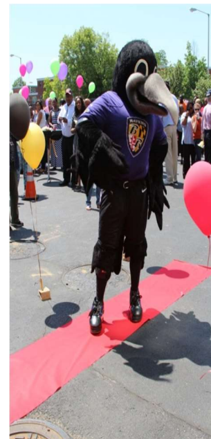
Poe, the official Mascot of the Baltimore Ravens walked the red carpet during Employee Appreciation Day on May 9, 2018.