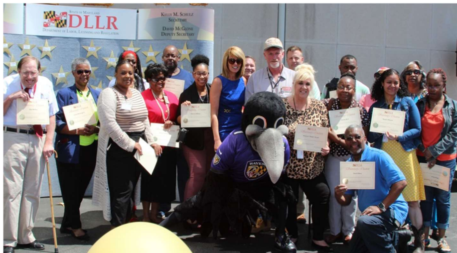
Several Maryland Department of Labor employees were recognized for providing excellent customer service. Each employee was recommended by a constituent who they helped.