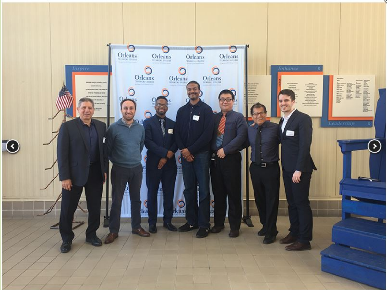
JEVS Human Services hosted an event for National Apprenticeship Week at JEVS Orleans Technical College. More than 60 high school students attended the event titled: Bridge to Employment — How apprenticeships can help you jumpstart a career in Health, IT and other occupations!