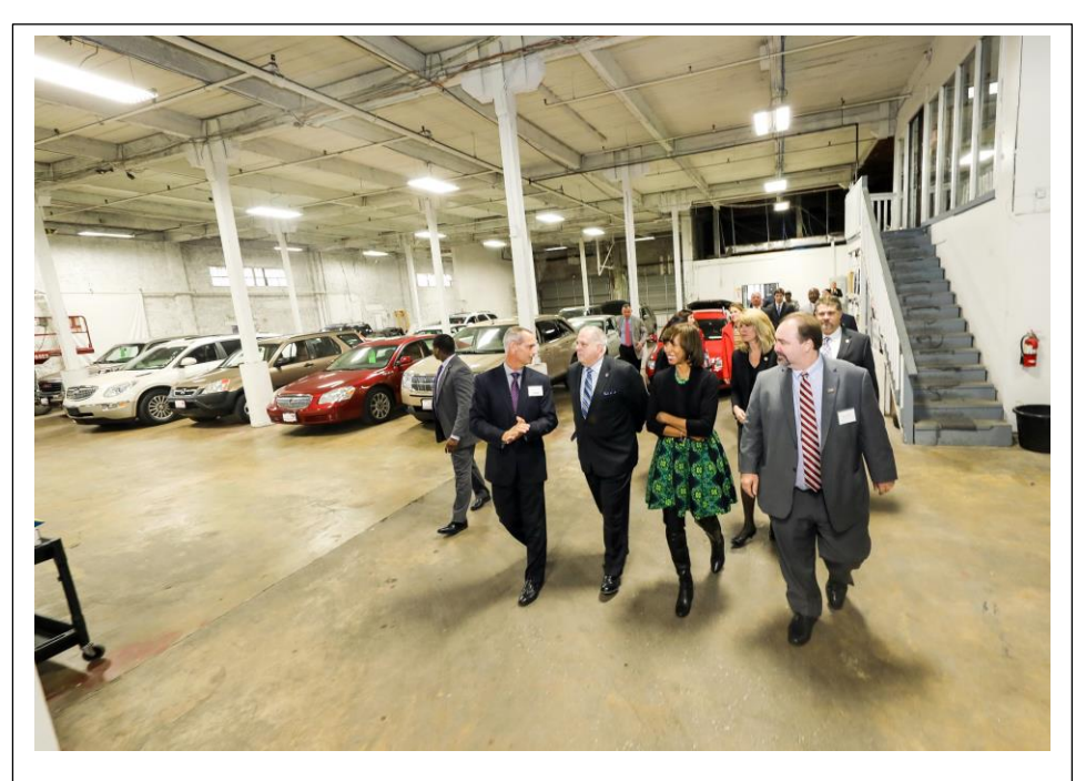
Governor Hogan visits Vehicles for Change at the signing of an agreement between Vehicles for Change and the Maryland Transit Administration