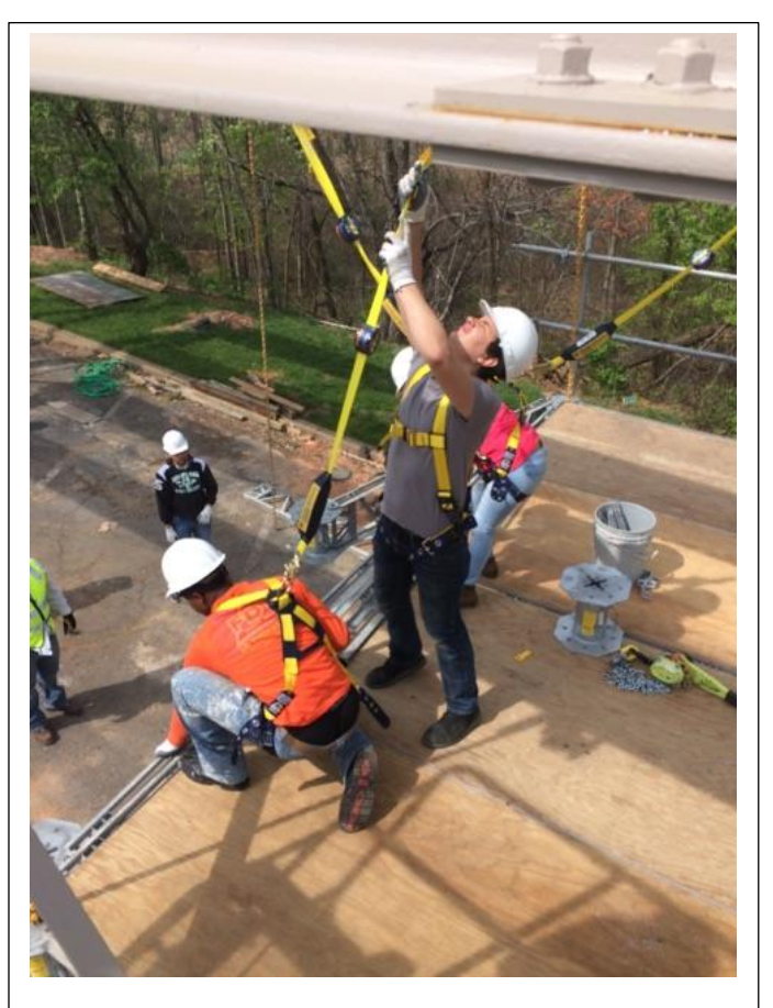
Participants with the Suburban Maryland Construction Initiative led by the Finishing Trades Institute

Many partnerships have chosen to modify training plans based upon feedback received from employer partners. For example, the Maritime Transportation and Logistics Partnership, led by Maryland New Directions, responding to the needs of it industry partners, modified its training plan to eliminate training for certifications that became obsolete due to new technology. Now, the partnership's revised training plan delivers in-demand training for the maritime industry, and employer partners and the jobseekers participating in training are more effectively served.