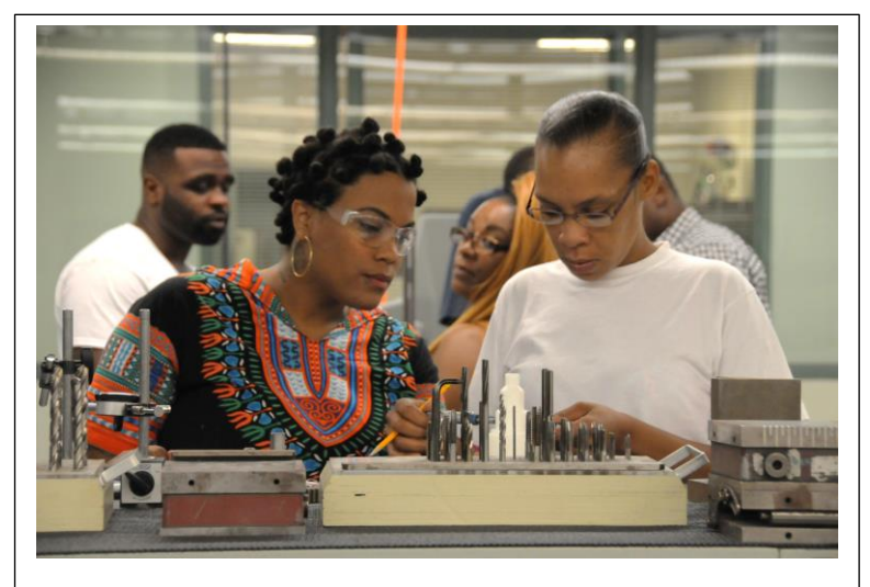
A participant with the Careers in Manufacturing program offered through the Jane Addams Resource Corporation

participants are eligible to receive public assistance benefits and close to 50% have a criminal record. The Careers in Manufacturing program offers two distinct tracks: welding and CNC machining. Welding trainees are averaging wages of $18.72 an hour, plus benefits, and CNC completers are making on average $15 an hour. To date, 28 different employers have hired JARC graduates and the Industry Advisory Council, which was established in 2015, remains engaged in identifying training needs and developing curriculum. In 2017, JARC will continue its Careers in Manufacturing program and also begin an incumbent worker training program in