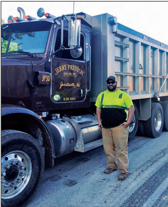
A graduate of the Susquehanna Transportation and Logistics Partnership visits training with his new vehicle.

newly developed diesel mechanic training in 2020. For example, based upon industry feedback, Anne Arundel Workforce Development Corporation, who leads A Road to Success, has developed a 200-hour training, which incorporates classroom instruction and hands-on experience. Candidates who complete this comprehensive training will be prepared for entry-level positions as technicians in diesel engine repair and related fields and will be eligible to sit for the Automotive Service Excellence (ASE) Automotive Maintenance and Light Repair (G1) certification exam.