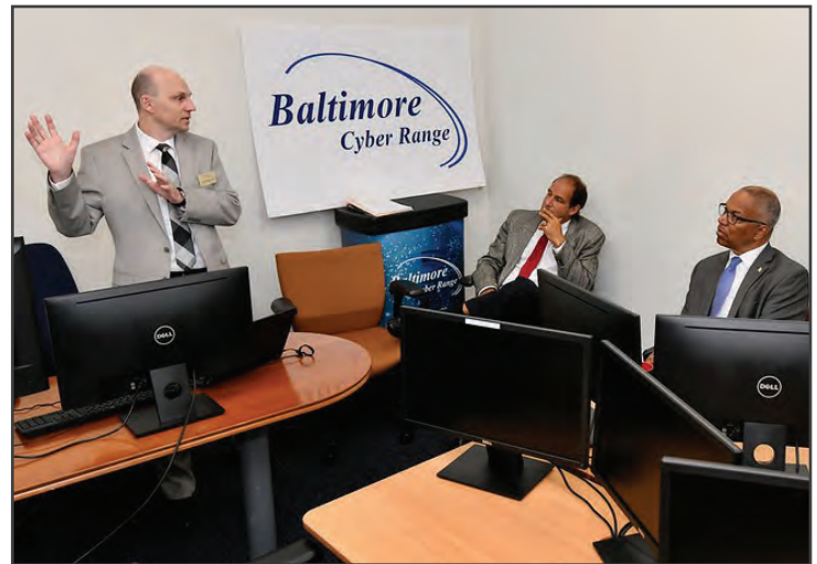
Lieutenant Governor Boyd Rutherford receives a briefing on the work of Baltimore Cyber Range, who leads two EARN partnerships.

The Intrusion and Countermeasures Education and Training Partnership is responding to the call of its 31 employer partners to provide a blend of classroom and hands-on training to ensure students have not only the technical knowledge, but also the practical skills necessary to be successful in the industry. Upon earning A+ and Net+ certifications, students receive employer-identified hands-on training at Baltimore Cyber, which includes simulations that mimic real-life cybersecurity threats. To date, more than 100 individuals have been placed into employment, earning an average wage of more than $17 per hour. In September of 2019, Lieutenant Governor Boyd Rutherford visited Baltimore Cyber to learn more about their efforts to create a pipeline of highly skilled workers for Maryland's cybersecurity employers.