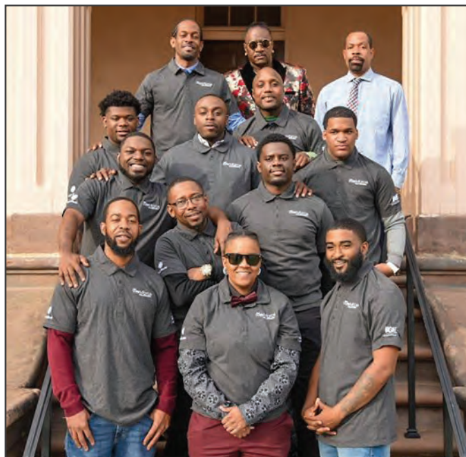
Graduates of the Remediation Construction Industry Partnership

Given the feedback from its employer partners, the Remediation and Construction Industry Partnership is providing in demand training to grow the pipeline of qualified workers to be Brownfields Remediation and Stormwater Management Technicians. Participants earn a plethora of certifications, including EPA Asbestos Supervisor; Lead Abatement Worker; OSHA 40 Hour Hazardous Site Worker Protection and Emergency Response, OSHA Confined Space Operations; OSHA Bloodborne Pathogens; and OSHA Fall Protection. To date, 99 participants have completed training, of which, 91 (92 percent) have obtained employment. In 2019, the RCIP developed a partnership with Baltimore Gas and Electric to connect RCIP graduates with careers in the utility infrastructure industry. In addition, BGE awarded lead applicant Civic Works a grant to expand the RCIP curriculum and develop new partnerships with utility infrastructure employers. This funding will allow the RCIP to scale operations, and enable the partnership to expand its services.