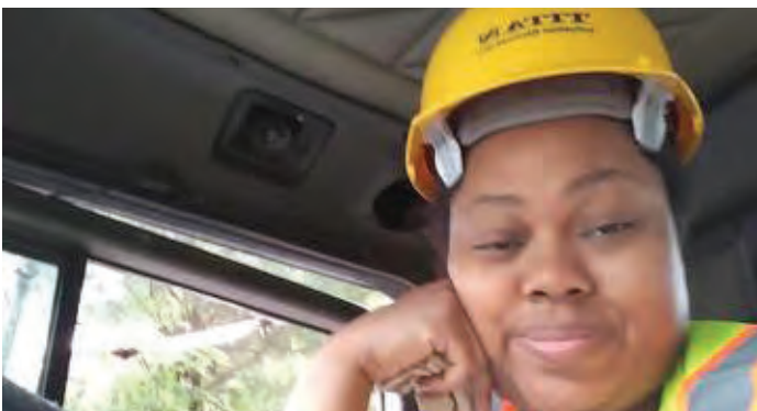
A graduate from Cecil College poses in her work vehicle.

Led by Cecil College, the Susquehanna Transportation and Logistics SIP continues to provide in-demand training opportunities for individuals to become commercial truck drivers. In 2020, the Susquehanna Transportation and Logistics SIP began offering the Professional Truck Driver