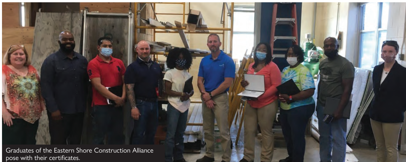
Graduates of the Eastern Shore Construction Alliance pose with their certificates.

Applicants must prepare a Data Source List that includes all existing data sources that were used to support the development of their proposal. This information will be included in the EARN 2022 Annual Report.