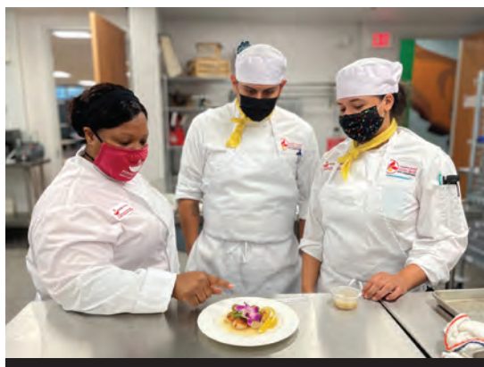
FoodWorks students receiving feedback on their dishes.