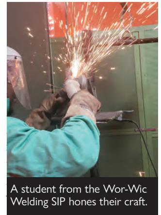
A student from the Wor-Wic Welding SIP hones their craft.

The demand for welders and metal fabricators on the Eastern Shore is expected to skyrocket emerging offshore wind industry. In preparation of this demand, the Wor-Wic Welding SIP demand training for entry-level positions. The partnership offers two training tracks. The first course that teaches stick, flux core, MIG, and TIG welding. The newly implemented metal fourteen weeks and prepares students to earn up to ten OSHA certifications. To date, more have obtained employment with employers such as Chesapeake Shipbuilding, Delaware and Cambridge International. The Wor-Wic Welding SIP was awarded additional funds, which beginning in January of 2022.