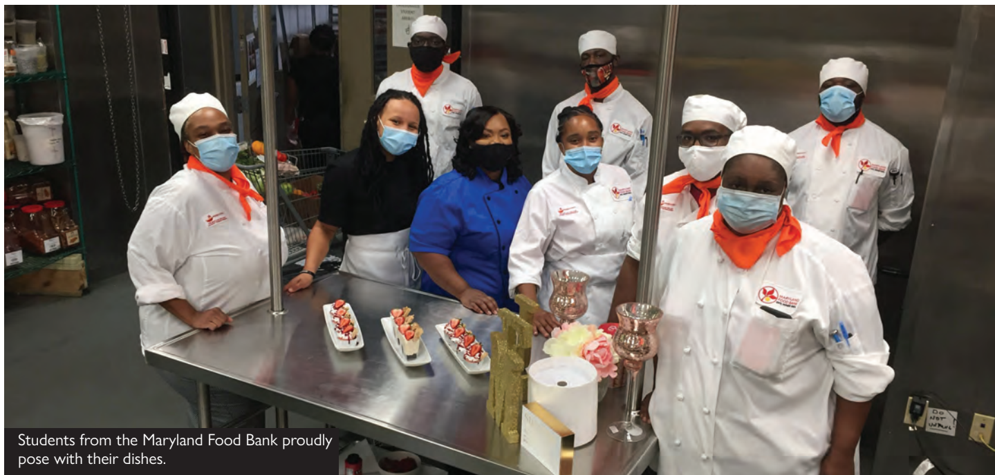
Students from the Maryland Food Bank proudly pose with their dishes.