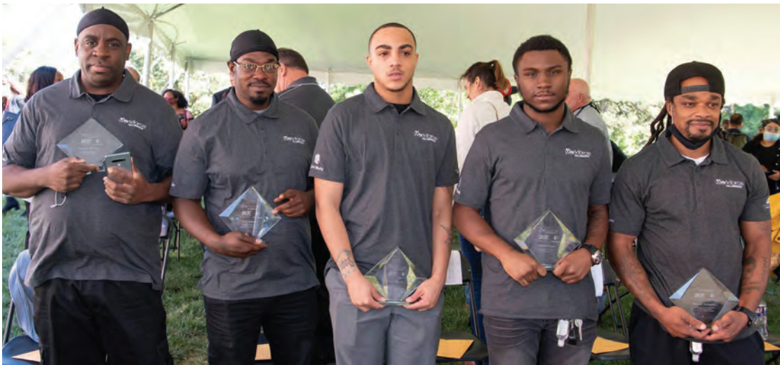
Students from the Remediation Construction Industry Partnership pose at graduation.