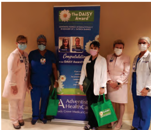
Nurse preceptor from Adventist receiving the DAISY Award which honors extraordinary health-care workers.

The Specialized Nursing Bridge Program, led by Adventist, continues to work to increase retention among first year nurses through their nurse preceptor training program. Individuals who serve as preceptors play a pivotal role in the successful onboarding of new nurses, while providing quality patient care to individuals in facilities. On average, the program has a significantly lower attrition rate as compared to nurses who do not enroll in the program. Employer and industry partners believe that investing time and resources into new nurses not only leads to improved quality of care and the safety of patients, but as a byproduct, leads to a significant increase in nurse retention. To date, nearly 400 individuals have received training.