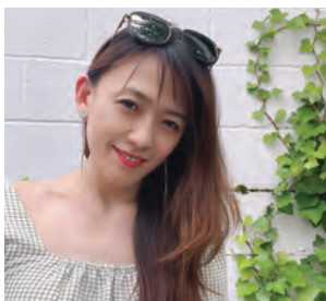
Student from the Asian Center of Frederick.

Led by the Asian American Center of Frederick, this partnership is providing training to grow the number of Community Health Workers (CHW) in Western Maryland. Students are able to obtain employment in a variety of settings, ranging from hospitals to Local Health Departments, and make a meaningful impact in the community, providing services to marginalized populations. The program recently received accreditation as a CHW Certification Training Program, receiving approval from