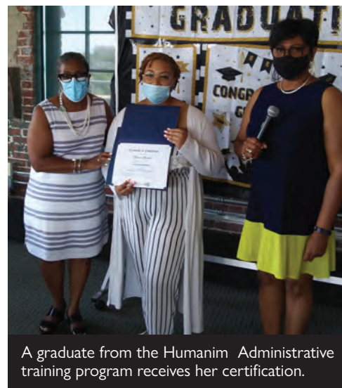
A graduate from the Humanim Administrative training program receives her certification.

The Baltimore Regional Healthcare/Higher Education SIP, led by Humanim, offers a 9-week training to prepare participants for careers as administrative assistants in the healthcare and higher education fields. Students have the opportunity to earn industry-recognized certifications, including Microsoft Office and the Professional Certificate of Excellence from the Association of Administrative Professionals. In addition, the program provides coaching, essential skills training, and comprehensive wraparound services. In 2021, the program expanded to Harford County, with the first cohort launching in November. To date, 70 individuals have obtained employment with employers such as Johns Hopkins Health System, University of Maryland Medical System, and Towson University. The partnership received additional funds which will allow training to continue into 2022.