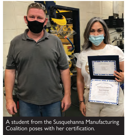
A student from the Susquehanna Manufacturing Coalition poses with her certification.

Led by the Susquehanna Workforce Network, this partnership continues to meet the needs of its employer partners, including W.L. Gore, Nu-Tek Precision, and PlastiPak Packaging, by providing an array of training opportunities to unemployed, underemployed, and incumbent workers. Manufacturers in the region continue to struggle to attract individuals to entry-level positions. Thus, the Susquehanna Manufacturing Coalition is providing Production Technician training, which gives students the necessary foundational skills to obtain employment. At the same time, the need remains to upskill incumbent workers. To date, nearly 70 individuals have obtained employment and 60 incumbent workers have received training, increasing their skillsets and becoming more valuable to their employer. In 2022, the partnership will use funding to train nearly 30 individuals and establish a Manufacturing Navigator, whose role will be to increase awareness of the industry in the region.