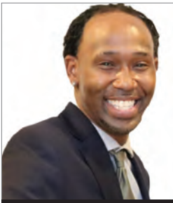
A graduate of the Power52 program proudly poses at graduation.

OSHA 10, 75 lab hours, and 20 hours of job readiness training. Power52 is committed to increasing the number of women in the industry, which is evidenced by an average of 30% female representation in the last two cohorts. Nearly 100 individuals have obtained employment after completing this training. The partnership received additional EARN funding to continue training into 2022, which will support 38 learners.