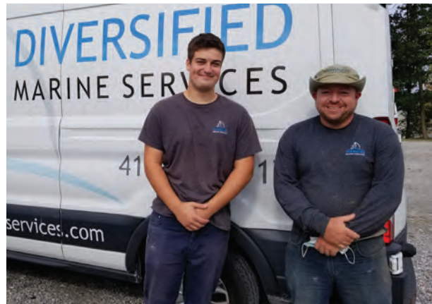
A student from Marine Trades Industry Partnership poses with his employer.

Led by the Marine Trades Association of Maryland (MTAM), the Marine Trades Industry Partnership continues to work diligently to meet the needs of its more than 90 employer partners. Incumbent worker training remains a high priority in the industry. To date, close to 200 individuals have received training in a variety of topics, including Yamaha Outboard Repair, Travel Lift and Hydraulic Trailer Operation, and Marine Systems. Additionally, like many of the skilled trades, the marine trades is experiencing difficulty recruiting a pipeline of workers to fill the positions of retiring baby boomers. As such, the partnership continues to implement their successful internship program. Students learn technical skills and receive hands-on experience with industry employers. In the partnership's most recent grant, 90% of the individuals who completed internships accepted full-time employment in the industry. The partnership will continue its work in 2022.